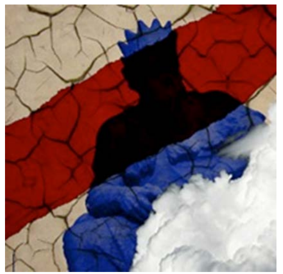
Figure 7. The "denouments" of the "Yılan Adası'

The Legend regarding the Yılan Adası (Snake Island), known as Yasak Aşklar and Küskünler before, starts when a fisherman who lives in a place where living conditions are very hard with his wife and daughter drawn in the sea when they were trying to escape from the King. The King understands how hard it is to survive in that place and with admiring the loyal wife of the fisherman who was able to survive from the sea, he made a statue of the woman. The story ends with the King drowning while watching the sea with hope and with him dying. The King is removed from the stomach of a snake which is one the reasons why the legend is named "Yılan Adası" (Snake Island). (Gökçeoğlu, 2004).