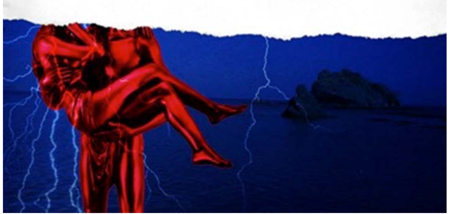
Figure 4. The "denouments" in the legend of "Gavur Kayalarının Gözyaşı."

Gavur Kayaları, where the virgin festivals are organized and where the Head Priest exploits religion, is painted with dark blue on the right side of the work. The physical proximity of the woman and man to each other, depicted in red, symbolizes the moment in which the feasts take place.