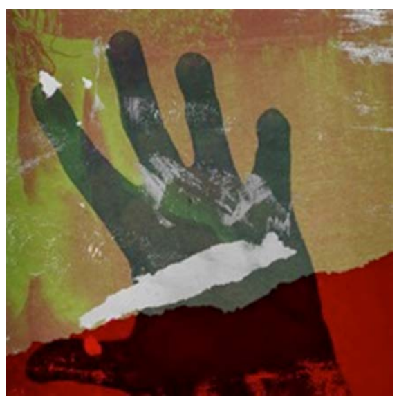
Figure 1. "Denouements" in the Legend of "Besparmak Dağı"

Both men were sank into the marsh that they fell into and tried to survive and caused the death of both due to the canniness of 'mean-spirited' man. Pursuant to the legend, the visual of hand in the air representing the form of Beşparmak Mountains in its existing form is at the core of work. It is possible to interpret from the position of hand that the 'good-hearted' man drawn into the marsh was asking for help. The colour of hand that showed the last stand was chosen as brown, which is considered as the colour tone of marsh. The white torn forms in the palm symbolises him being unanswered for his call of help.