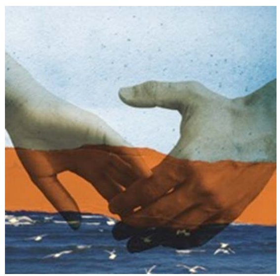
Figure 8. The "denouements" of the Legend "Death of the Sarnıç Kızlar"

The two lovers described droughts and troubles ending with their tears joined the feast in the cistern and disappeared among the sea foams, by jumping off from the cliff. It is possible to grasp the beloved by the hands and feet of the male and female visuals in the work of visualizing two lovers' leaving themselves to the sea. Coupled with the eternal journey after the jump to the sea, the couple is represented by the image of birds flying over the sea.